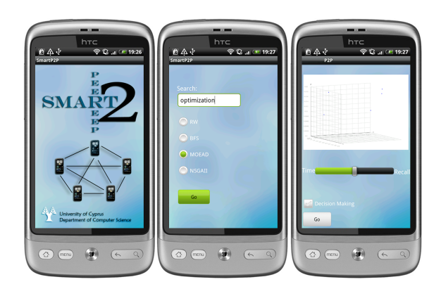
Fig. 2. The SmartP2P Android GUI. The intro screen (left), the keyword search optimization with four algorithmic choices screen (center) and the resulted Pareto Front screen for decision making (right). The Pareto Front is forwarded from the optimizer and displayed to the user's GUI. The slide bar shows the user's preference with respect to the recall and time overhead objectives, if the decision making checkbox remains untick then the QRT with the minimum energy is automatically selected.

The SmartP2P Optimizer: Figure 2 (center) shows the GUI through which a query, for example of the keyword "optimization", is formulated in order to find objects of interest. In the GUI, the group of algorithmic choices provided by the SmartP2P framework is shown. SmartP2P provides (a) two simple distributed choices, i.e. Random Search and Breadth-First Search, as well as (b) two MOO choices, i.e. the MOEA based on Decomposition (MOEA/D) and the Non-Dominated Sorting Genetic Algorithm II (NSGA-II). The user selects an algorithm and presses the "Go" button. Then the SmartP2P optimizer calculates a QRT in case (a) or a Pareto Front in case (b). In both cases the result is returned to the query user.