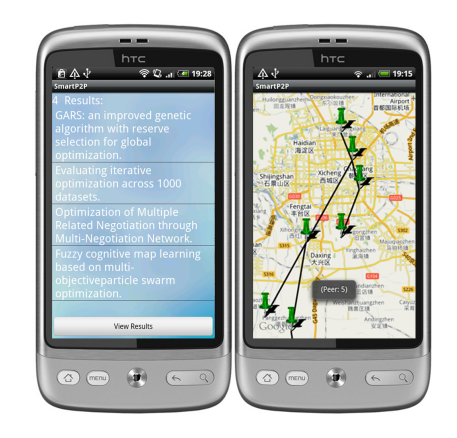
Fig. 3. The results retrieved after initiating a P2P search on the Smartphone network (left). The QRT selected by the query user and initiated to retrieve the objects of interest (right).

The SmartP2P Search: The query user initiates the search. The results of the search as well as the selected QRT are both displayed on the user's Smartphone as shown in Figure 3.