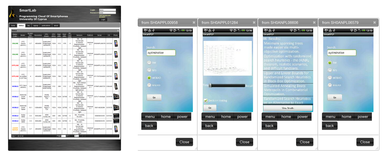
Fig. 4. The SmartLab cloud of Smartphone devices (left). A screenshot of the SmartP2P on SmartLab (right)