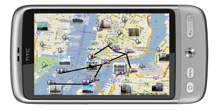
Fig. 1. A visual illustration of the Multi-Objective Query Routing Tree (MO-QRT) structure proposed in this work. Our SmartOpt Framework constructs MO-QRT structures optimized on several conflicting objectives (i.e., energy, time and recall). Our structure can be utilized for finding objects (e.g., images, videos, etc.) in a social neighborhood, without the necessity of having the objects disclosed to the social network provider.

<sup>1</sup>We define a Smartphone Network as "a set of smartphone devices that communicate in an unobtrusive manner, without explicit user interactions, in order to realize a collaborative or social task."