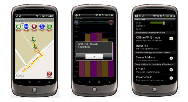
Fig. 2. Screenshots of the prototype system Left: The matched GPS trajectory displayed using Google Maps; Middle: A Query Response Message for RSS trajectories; Right: Parameter configuration and mode selection panel.

future; for instance, an attendee might be able to determine other attendees that have participated in common sessions, in order to initiate new discussions and collaborations.