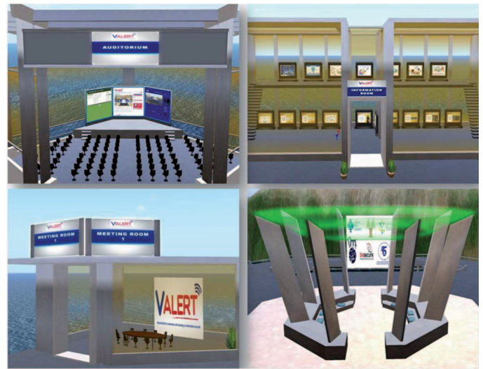
Fig. 2. The welcome area of the 3DVW learning environment

The main objective of the Password Protection scenario is to educate the user to create strong passwords on on-line portals and social networks.