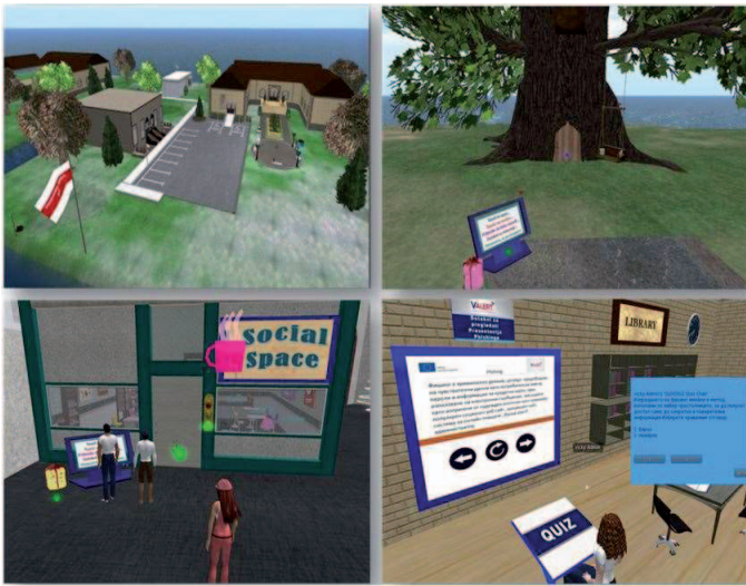
Fig. 1. Various games inside the 3DVW learning environment